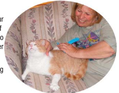
Toffee & Marilyn

Allow us to introduce you to some of our ‘Fradies’ who have gone friendly!