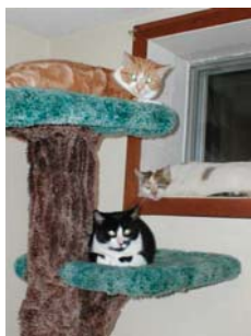
Three Former Fradies