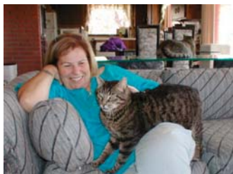
Charlie & Marilyn

Charlie was the first cat PAWS rescued with feline aids (in 2000). He is doing very well but requires monthly injections called ‘depo’ to help with a re-occurring problem with his gums. Would you consider sponsoring Charlie and covering this expense of $35 per month?