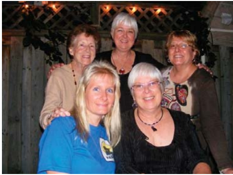
Animal rescuers taking a much-needed break

They say a picture is worth a thousand words and the following pictures show that everyone had a terrific time while raising much-needed funds for homeless animals.